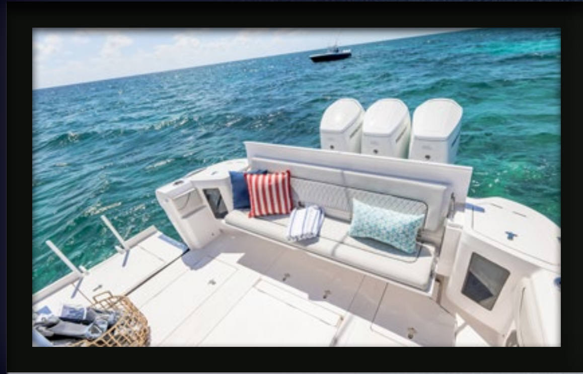
► Twin transom baitwells with windows and optional rear bench seat that folds away when it's time to fish.

Your choice of an optional grill station and sink, plus refrigerators/ice makers, coolers, and electronics invite you to customize the boat of your dreams.