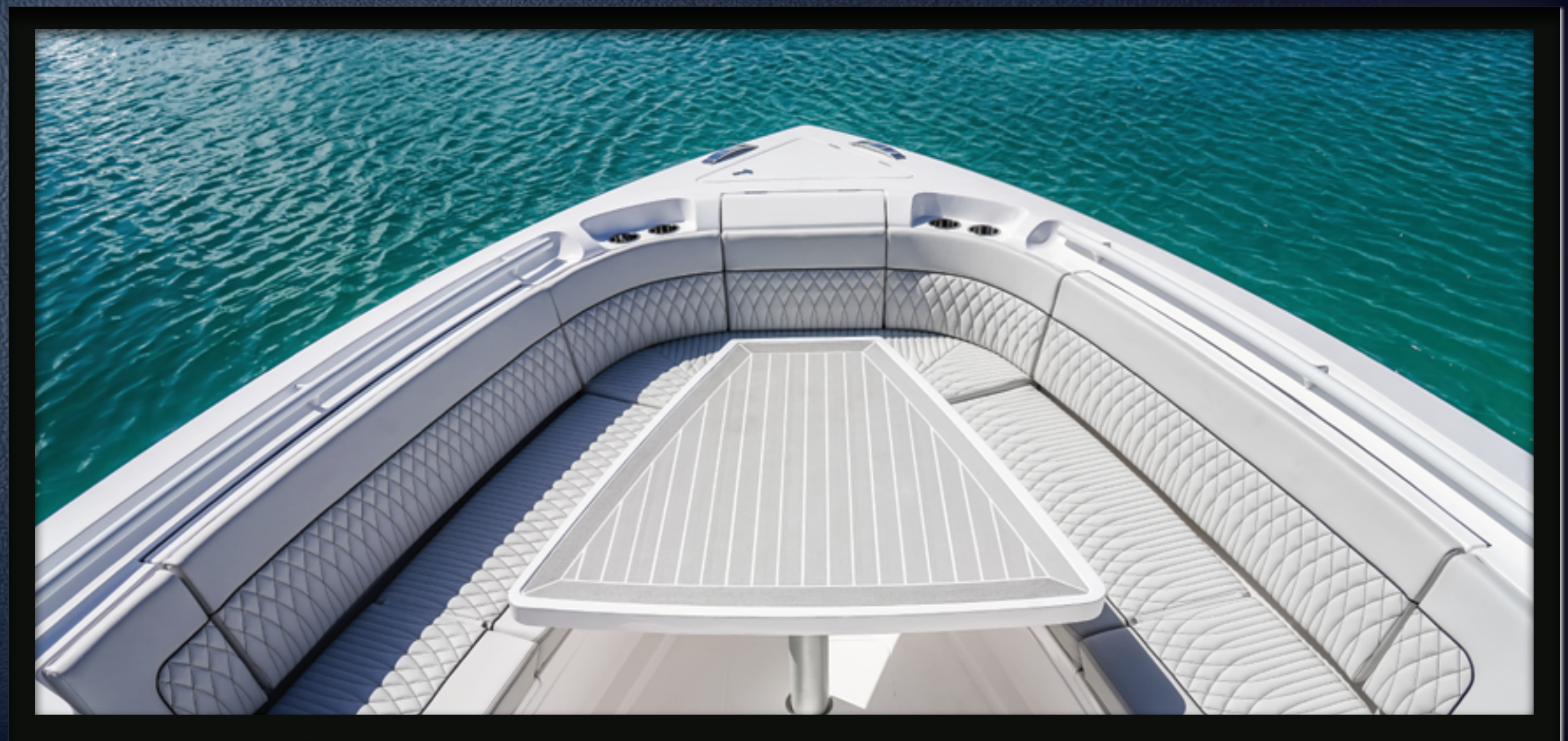
► Forward seating with electric backrests and high-low table that creates a spacious sunpad or goes flush in the floor when fishing.

The FE on this expansive new Nomad stands for the front entry to a spacious hideaway head beneath the helm station. Exceptional comfort and privacy come courtesy of a separate head and freshwater shower, with lighted vanity, sink, and hanging locker with ample storage for toiletries and towels.