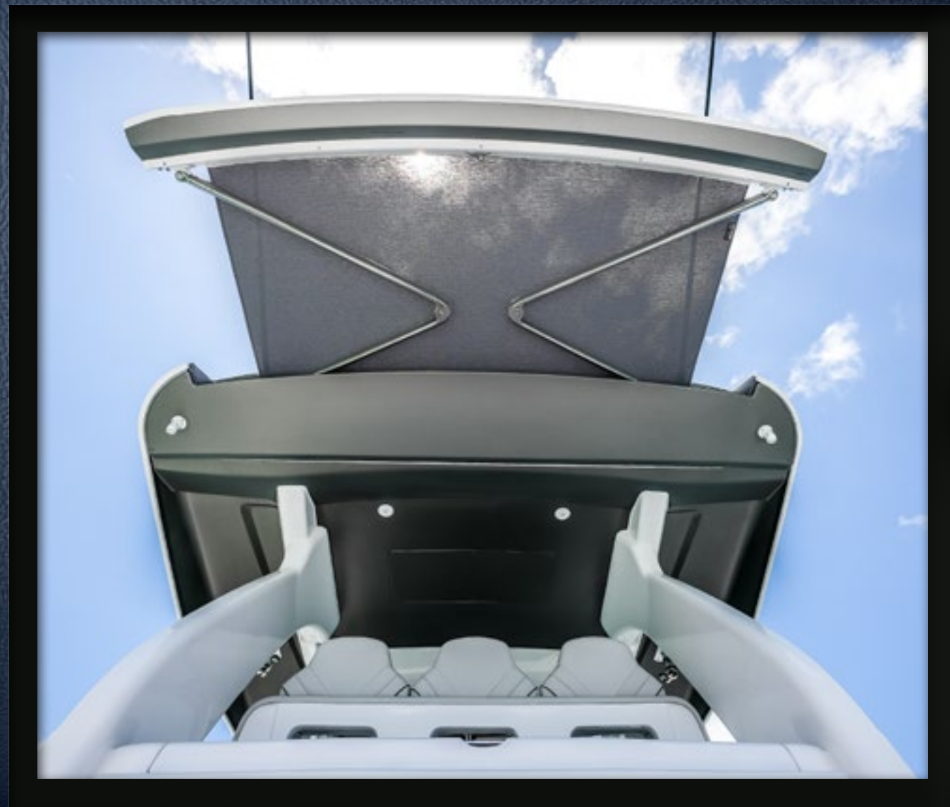
► Standard electric aft sunshade system helps keep everyone cool.

The wide console also offers abundant real estate for your favorite array of today's larger, flat-screen electronics, not to mention additional storage, and endless opportunities for customization.