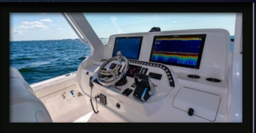
► Expanded console creates space for even the largest flat-screen electronics.