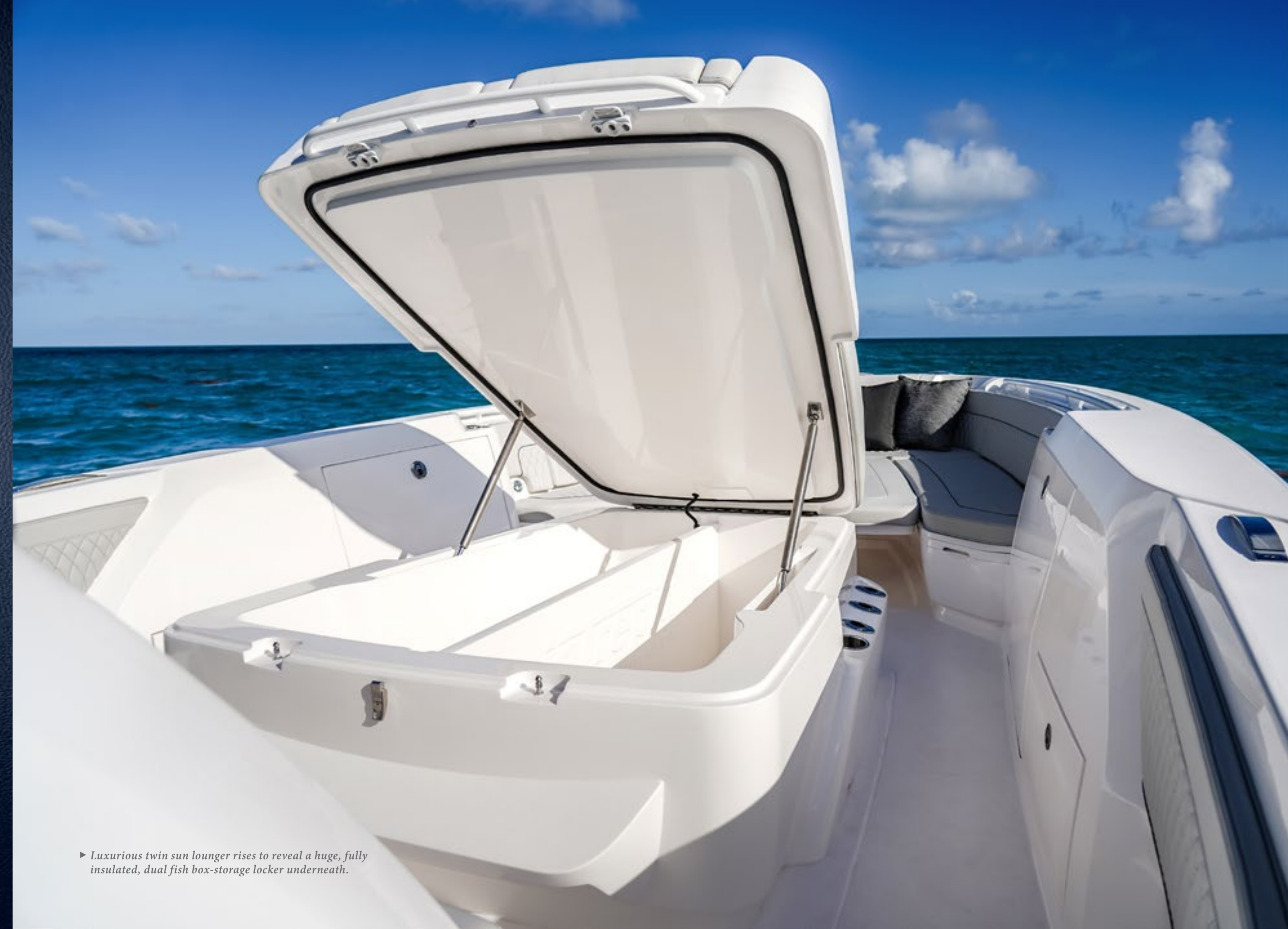
► Luxurious twin sun lounger rises to reveal a huge, fully insulated, dual fish box-storage locker underneath.

Twin transom dive platforms are complemented by our signature swing-in, hullside dive door with fold-out ladder. On the other side of the cockpit, we've added an innovative new feature from our flagship 477 Evolution Sport Yacht that owners absolutely love: a spacious new hydraulic hull platform with fold-out ladder and grab bars that makes it easier than ever to stage up your dive gear, and for one person to assist another in getting in and out of the water. You're welcome.