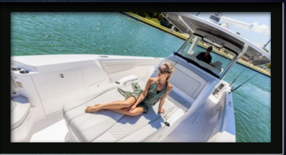
► Full-height glass windshield provides maximum visibility and protection from wind, rain, and spray.