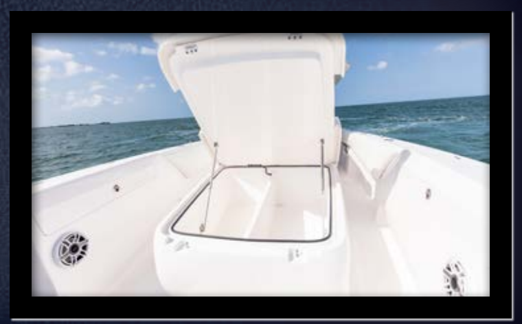
▶ This fully insulated box can be used for storage or keeping your catch chilled