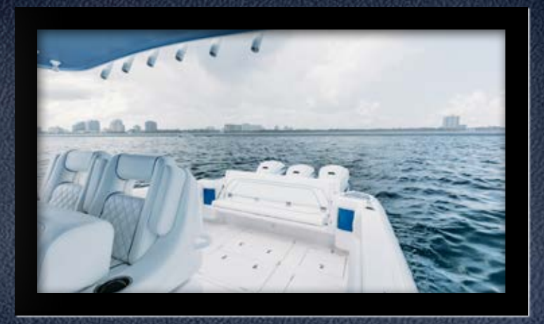
▶ The fold-away rear bench seat makes even more space in the aft when you're ready to battle the fish.