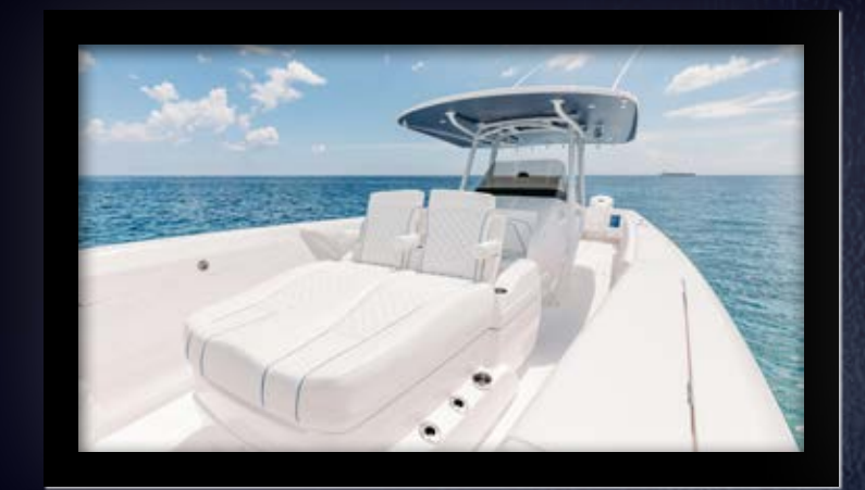
▶ From bow to stern, you'll find comfortable spaces to relax and enjoy the wave-crushing ride.