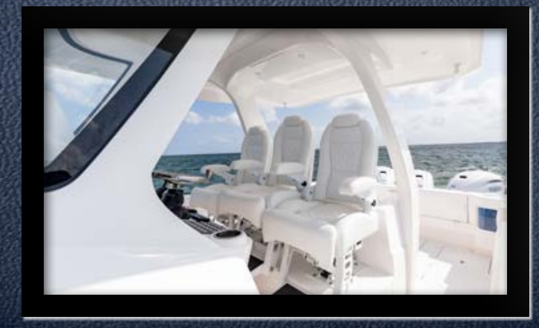
The helm seat features a premium FRP hardtop, glass windshield, wiper, >> Enjoy the smooth, stable ride as you lounge in ultimate comfort. helm seat cabinet and enough real estate to house all of your electronics.