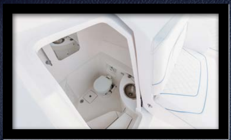
The console with a front entry makes it easy to access the electric head with sink.