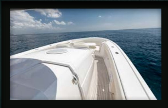
► Beautifully designed non-skid deck and easy entry to a luxuriously appointed cabin below.