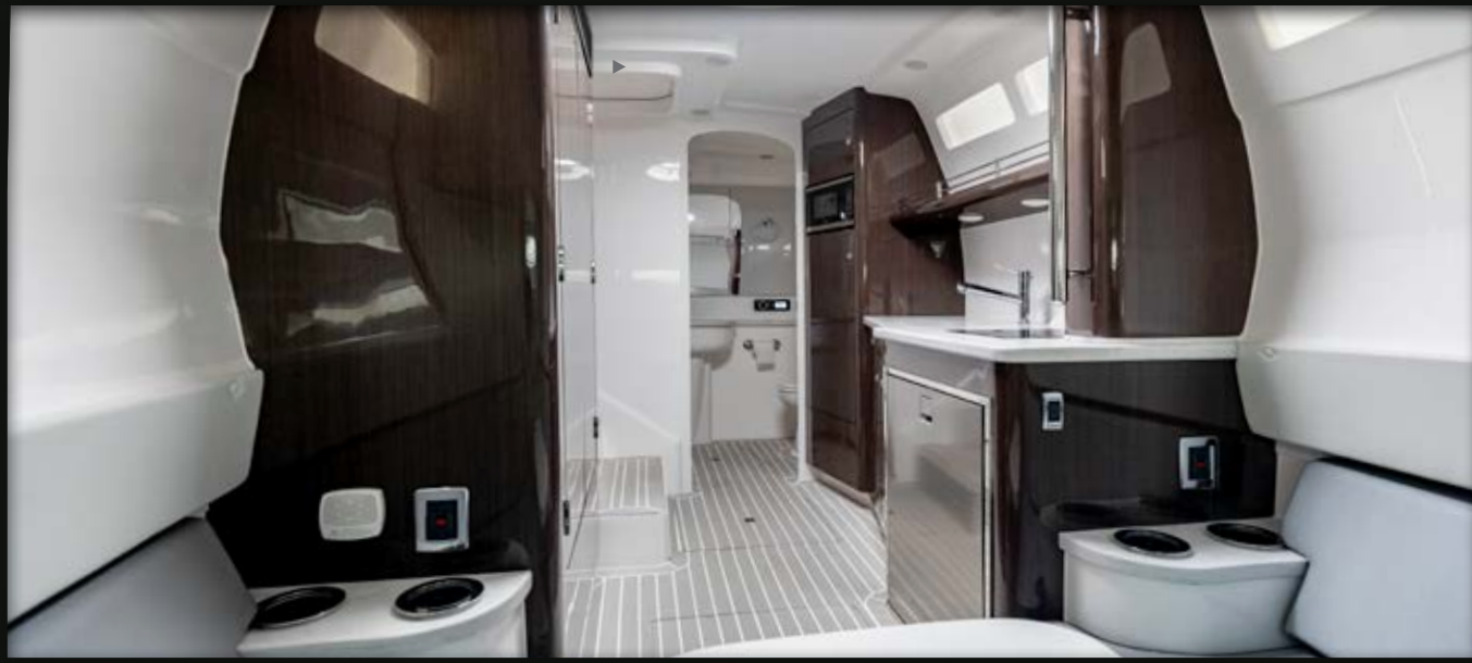
► The cabin is spacious and stylishly appointed with a high/low electrically actuating cabin V-berth table and adorned with high-end, wood-veneered cabinetry throughout.