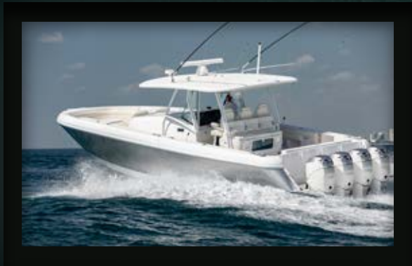
► High performance, sheer power and unadulterated luxury and fun await aboard the 475 Panacea.