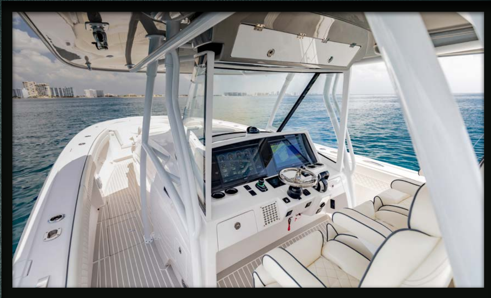
► The helm features a state-of-the-art platform for the largest of electronics.