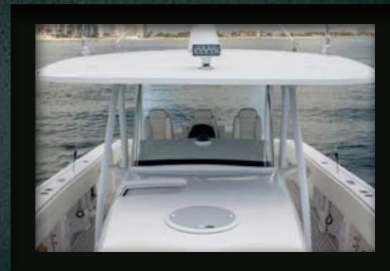
► The full windshield adds ultimate protection against the wind and elements.