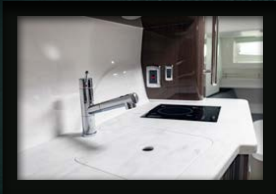
► The galley includes solid-surface countertops, a refrigerator, microwave and sink.

Step below into a vastly superior and lavishly appointed cabin. Here you'll find a roomy head with a separate shower, vanity and sink, a galley with refrigerator, sink and microwave, high-end cabinetry, solid-surface countertops throughout and a spacious V-berth for luxurious accommodations. You and your guests will quickly be feeling right at home wherever you're cruising to.