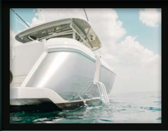
► A dive door features a swing-in door and our patented fold-out ladder for easy access in and out of the water.

STANDARD FUEL: 550 Gallons / BEAM: 13' 8" / LENGTH: 47' 6" / WATER: 130 Gallons