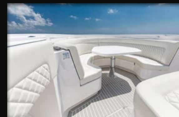
► An actuating high/low table lowers to create additional space for ultimate lounging.