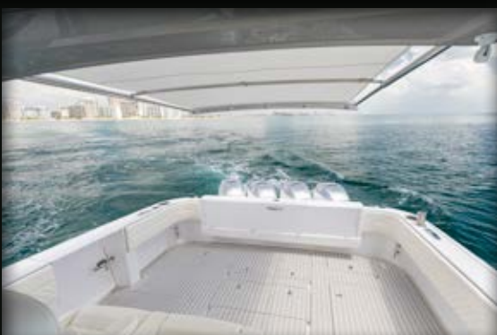
► The aft cockpit can be designed one of three ways. With a cabinet for your needs including a refrigerator, ice maker, sink and slide-out cooler; with a fishing station; or it can be equipped with comfortable second row seating.