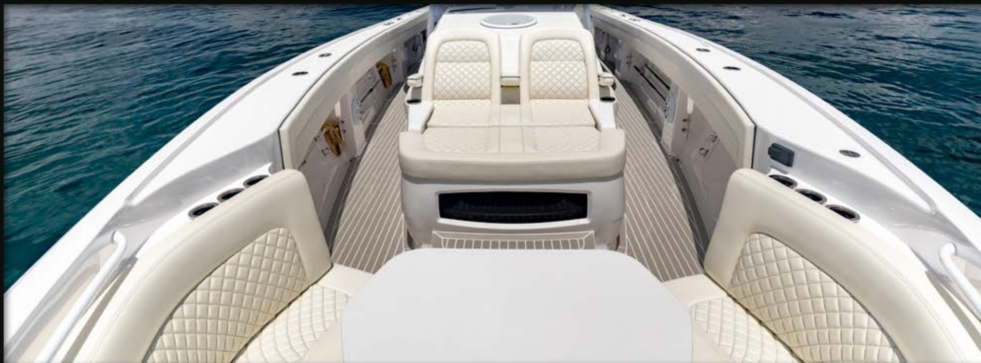
► Wraparound seating elevates comfort while also inspiring conversation among friends and family.

Your personal 47-foot floating paradise boasts an oversized sunpad and wraparound forward seating that neatly creates a VIP lounge by electronically converting to an alfresco dining area. An area that is large enough to entertain 10 passengers. Whether you're headed to Bimini for brunch, to Costa Rica to battle marlin or off to Capri for some shopping, you'll do it in style and comfort.