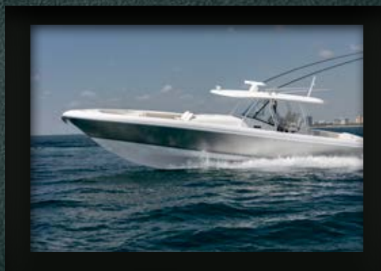
► Our patented step hull design ensures an incomparably smooth, stable and dry ride.