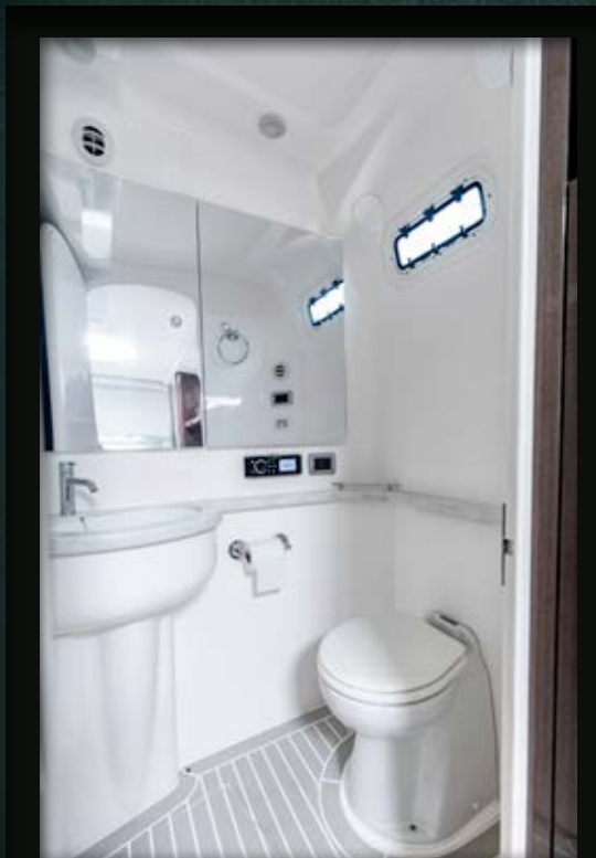
► The roomy head includes a sink with separate shower.