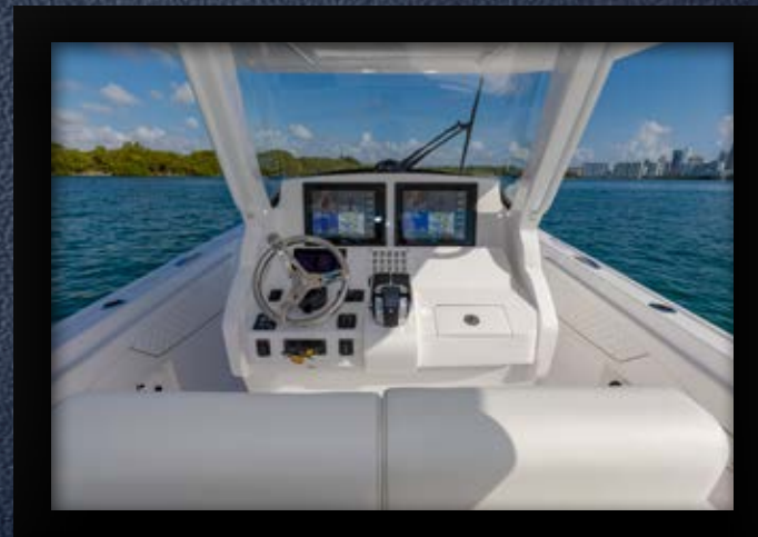
▶ An all new console has space for even the largest of electronics.