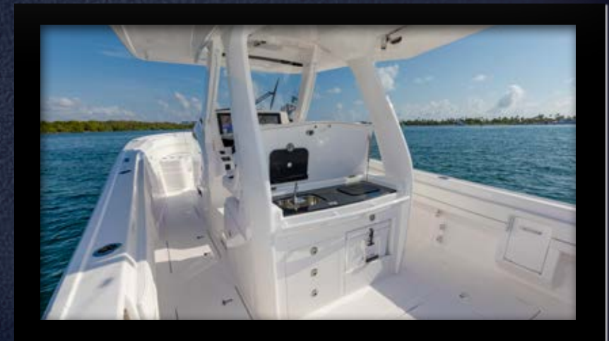
▶ The helm seat station can be customized to fit your every need and whim.