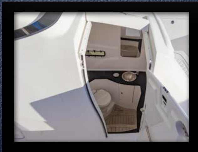
▶ The SE features a comfortable side entry to the head.