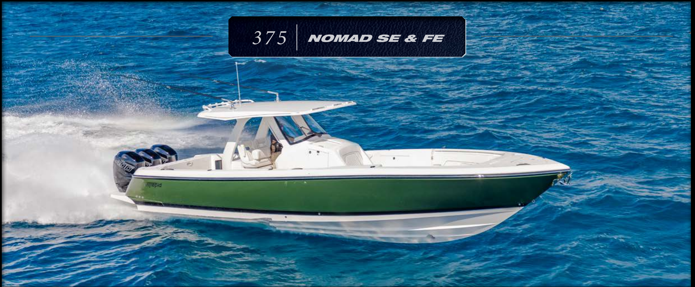
- THE 375 NOMAD SE -