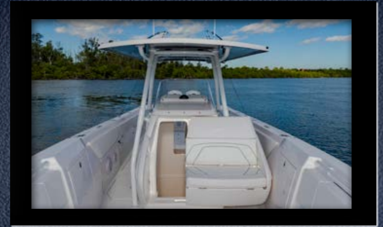
▶ The 375 Nomad FE features an innovative front entry into the head.