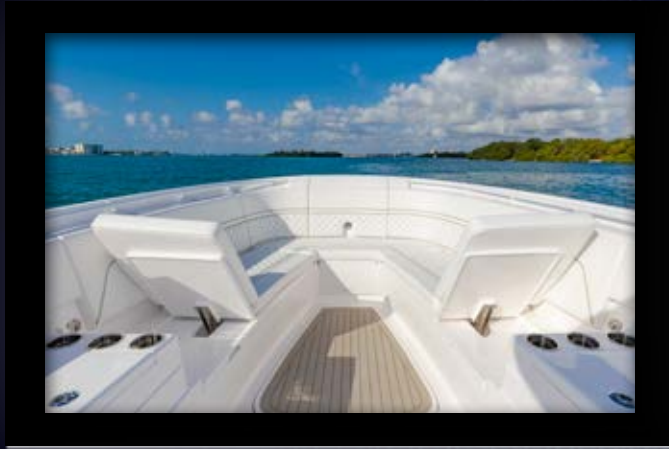
▶ A hi/lo actuating table can sit flush with the cockpit sole, become a filler for the forward seating and raise to table height.