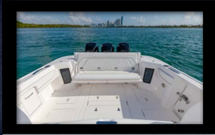
▶ Both models also feature an optional integrated folding rear seat. It's comfortable, convenient and easily folds away and disappears.