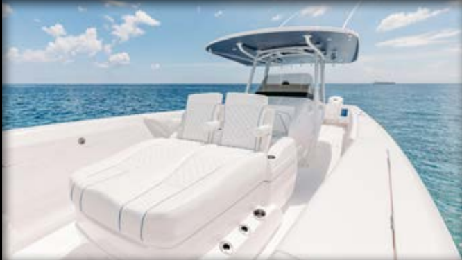
► From bow to stern, you'll find comfortable spaces to relax and enjoy the wave-crushing ride.