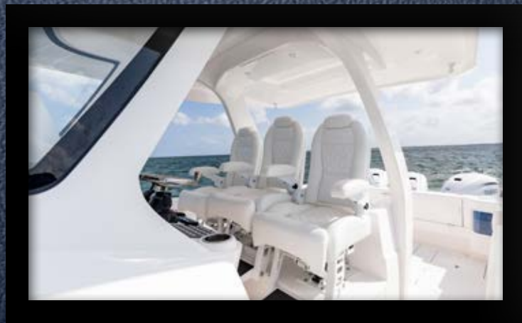
► The helm seat features a premium FRP hardtop, glass windshield, wiper, helm seat cabinet and enough real estate to house all of your electronics.