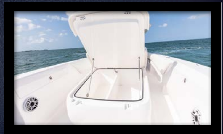
► This fully insulated box can be used for storage or keeping your catch chilled on ice.