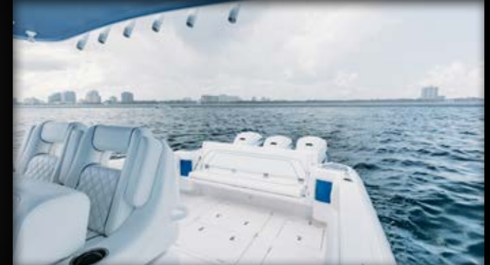
► The fold-away rear bench seat makes even more space in the aft when you're ready to battle the fish.