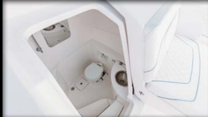
► The console with a front entry makes it easy to access the electric head with sink.