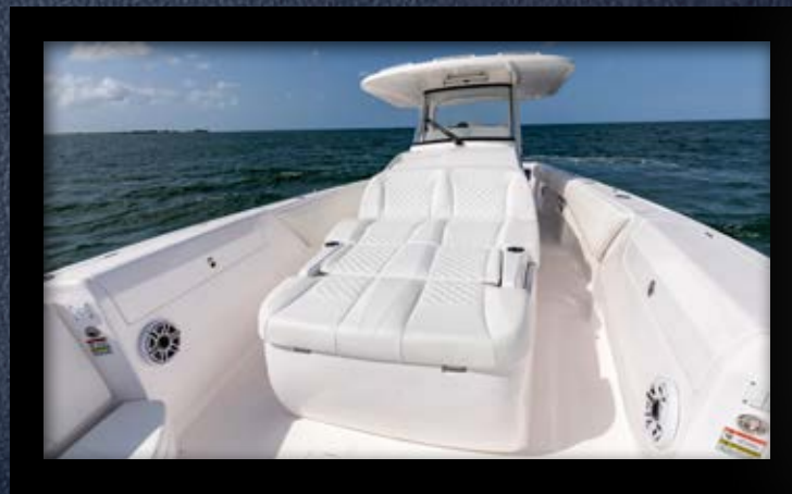
► Enjoy the smooth, stable ride as you lounge in ultimate comfort.