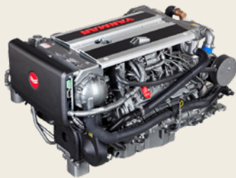
YANMAR 8LV 370 HP