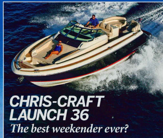
CHRIS-CRAFT LAUNCH 36 The best weekender ever?