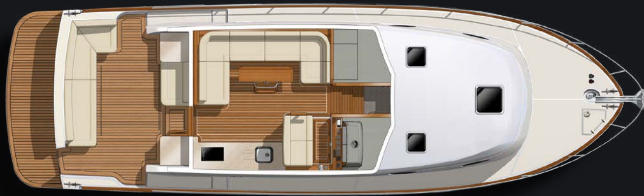
UPPER GALLEY TRIPLE SINGLES