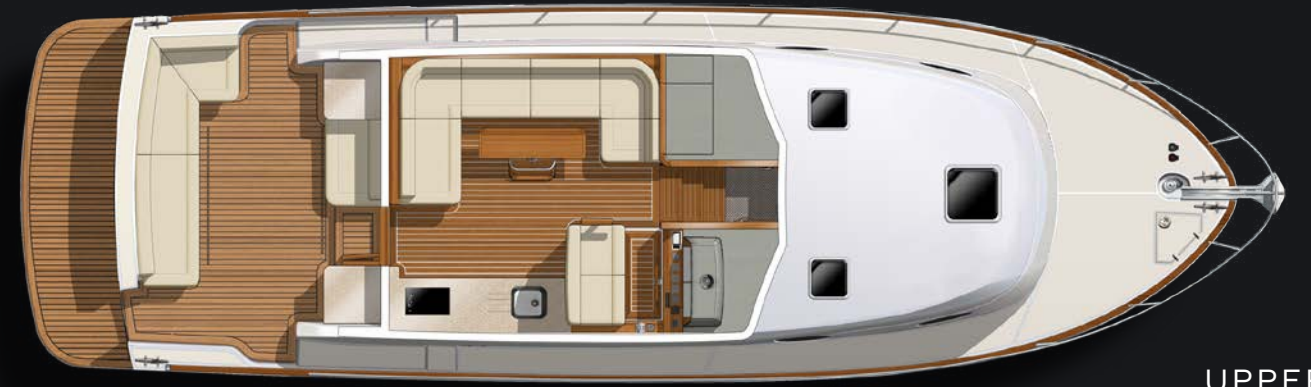
UPPER GALLEY AFT VIP