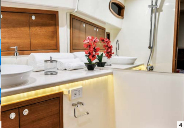
1. The wide-open interior features power windows and gleaming teak detailing. 2 & 3. Multiple staterooms with comfortable accommodations mean up to 6 guests can spend the night. 4. The sleek and spacious heads feature a shower and vanity with contemporary finishes.