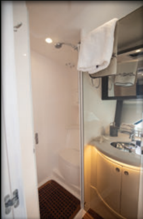
► Roomy private head with separate shower and vanity