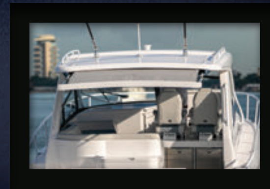
▶ New electric sunshade extends from the back of the top to cover the entire aft cockpit and provide a protected summer kitchen and lounge area