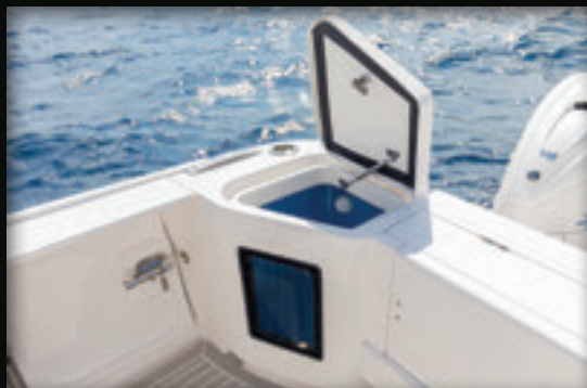
► Spacious aft cockpit with optional folding rear bench seat, two windowed bait wells, insulated storage / fishboxes and summer kitchen with grill and sink