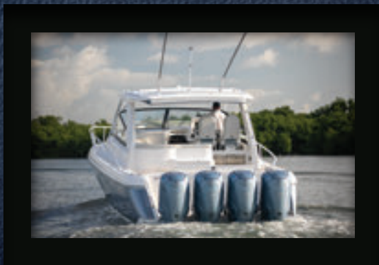
▶ Available from the top manufacturers, power packages can be custom painted to complement your boat's styling