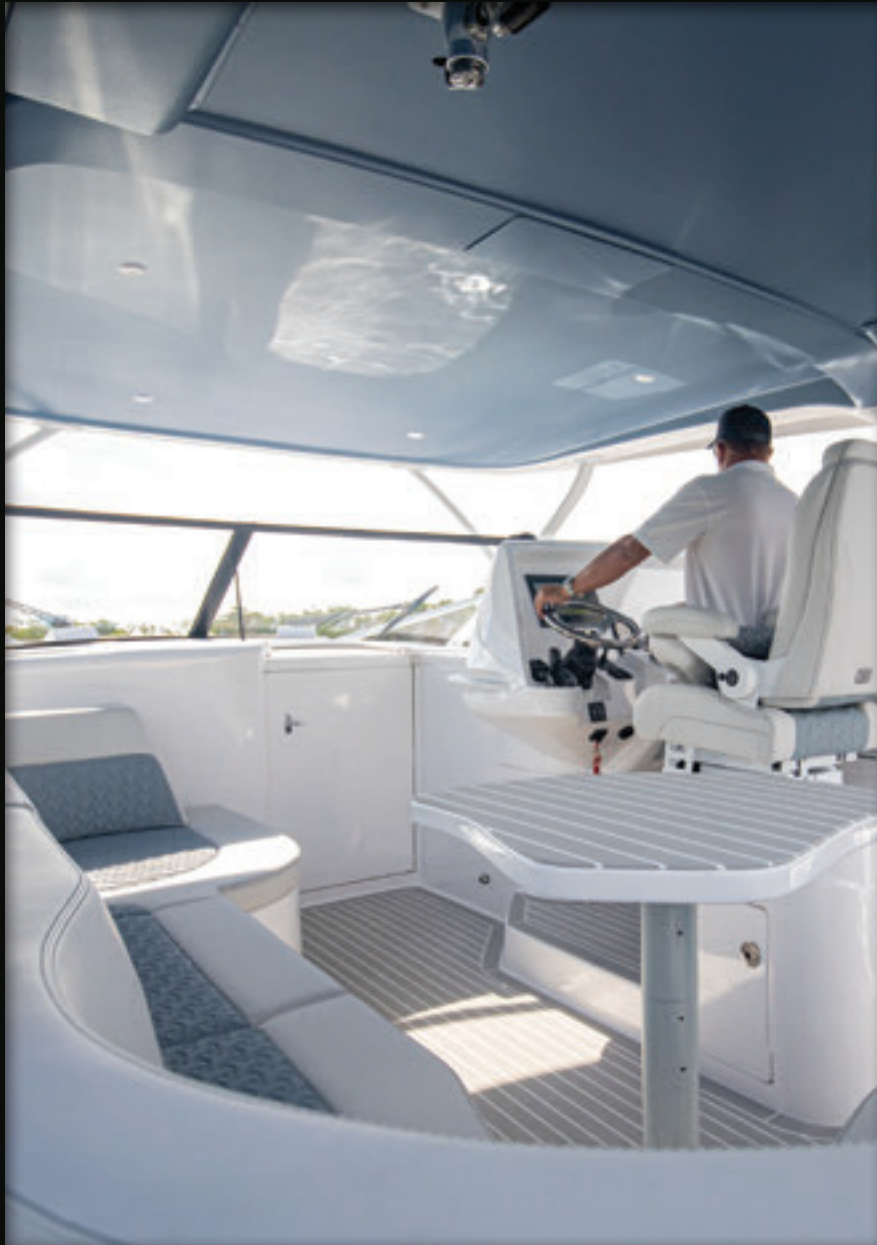
► Oversized bridge deck lounge with wraparound seating and hydraulic hi-low table

With a quad power package, the boat cruises comfortably at 48 mph, achieving top speeds that race up to a pulse-quickenning 68 mph! At any speed, our signature stepped hull design crushes waves and delivers a smooth, dry, sure-footed ride that is unmatched in the industry and instills confidence under any conditions.