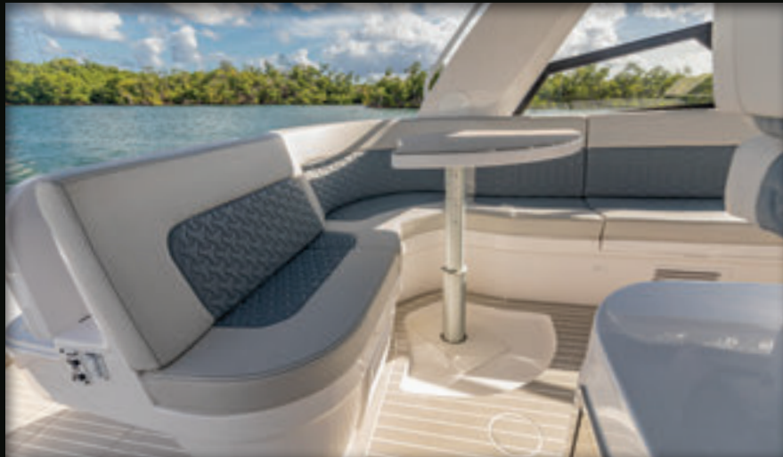
► Hydraulic table fits flush into deck, fills seating or goes to table height

The topside summer kitchen with fridge, grill and sink invites you and your crew to enjoy your fresh catch of the day under the protection of an ingenious electric sunshade that extends out over the entire aft cockpit. Up on the bow, our largest sun pad to date provides more than enough forward lounging space for group socializing and sunbathing.