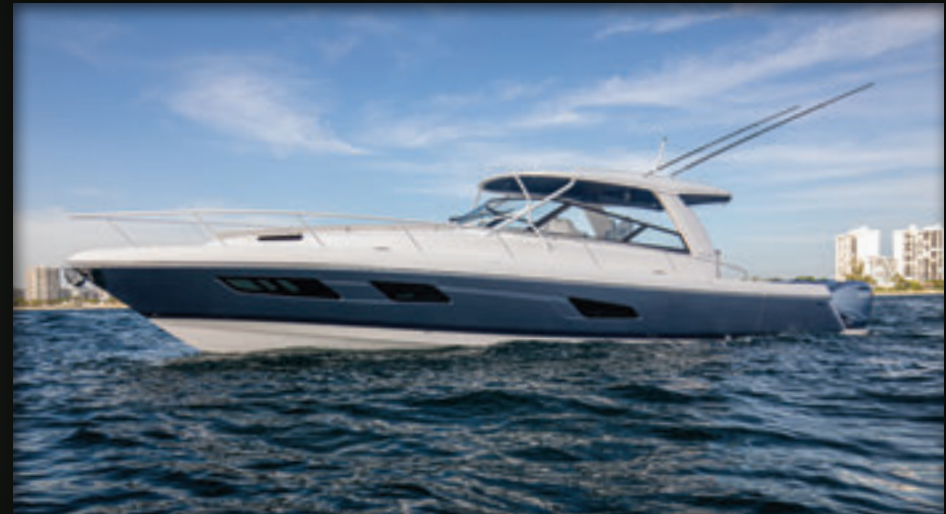
► Large hullside windows let in light and allow you to see out from below deck