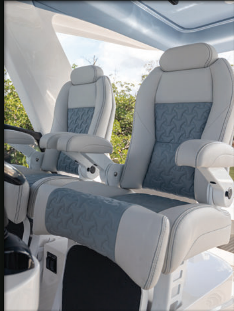
► Twin adjustable captain's chairs