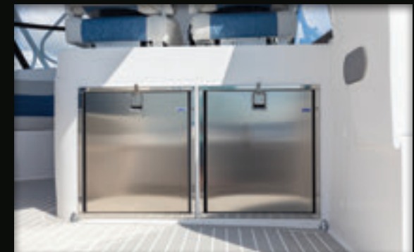
► Dual helm seating features a cabinet large enough to hold a side-by-side refrigerator / freezer