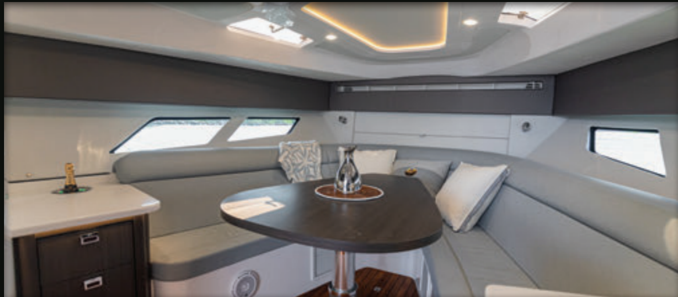
► Forward lounge seats eight and converts to a luxurious third berth. An array of ingenious storage, hanging lockers, end tables, designer lighting and thoughtful details like an optional 12-volt wine cooler in the settee side table provide yacht-class accommodations