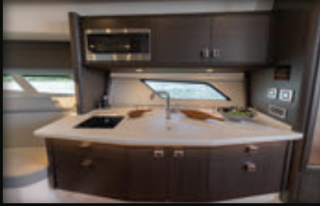
► Fully appointed galley with new Euro-style hardware, cabinetry and finishes

A surprisingly expansive cabin features twin queen-bed state rooms, a fully appointed galley, and an amazing amount of storage. There's a roomy head with separate shower and vanity. A large dining settee seats eight, then converts to a third berth for additional overnight guests. Each custom-built 477 Evolution is rigged and styled with all your favorite equipment, finishes and features, including state-of-the-art entertainment systems. Numerous hull-side windows and skylights flood the cabin with natural light. New accent lighting under countertops and cabinetry set an elegant mood in these yacht-class accommodations for family and friends.