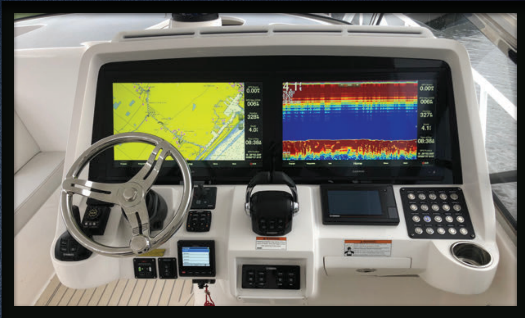
▶ A large console features luxurious heating and air conditioning vents, and plenty of room for all the latest electronics.