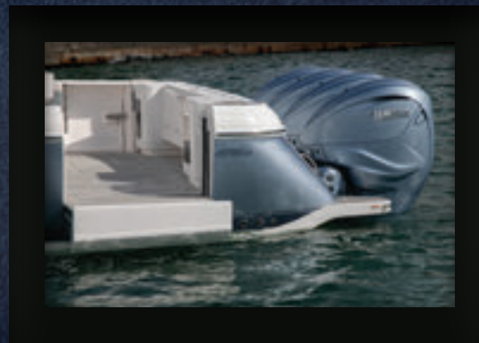
▶ A hydraulic hull-side swim platform with room for two people, a fold-out ladder and grab bars makes it easy to get in and out of the water.