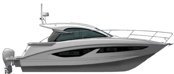
EU edition - outboard profile