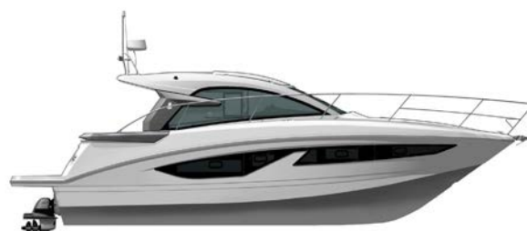
EU edition - inboard profile