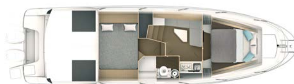
Lower deck - common to both versions