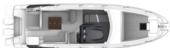
Outboard main deck